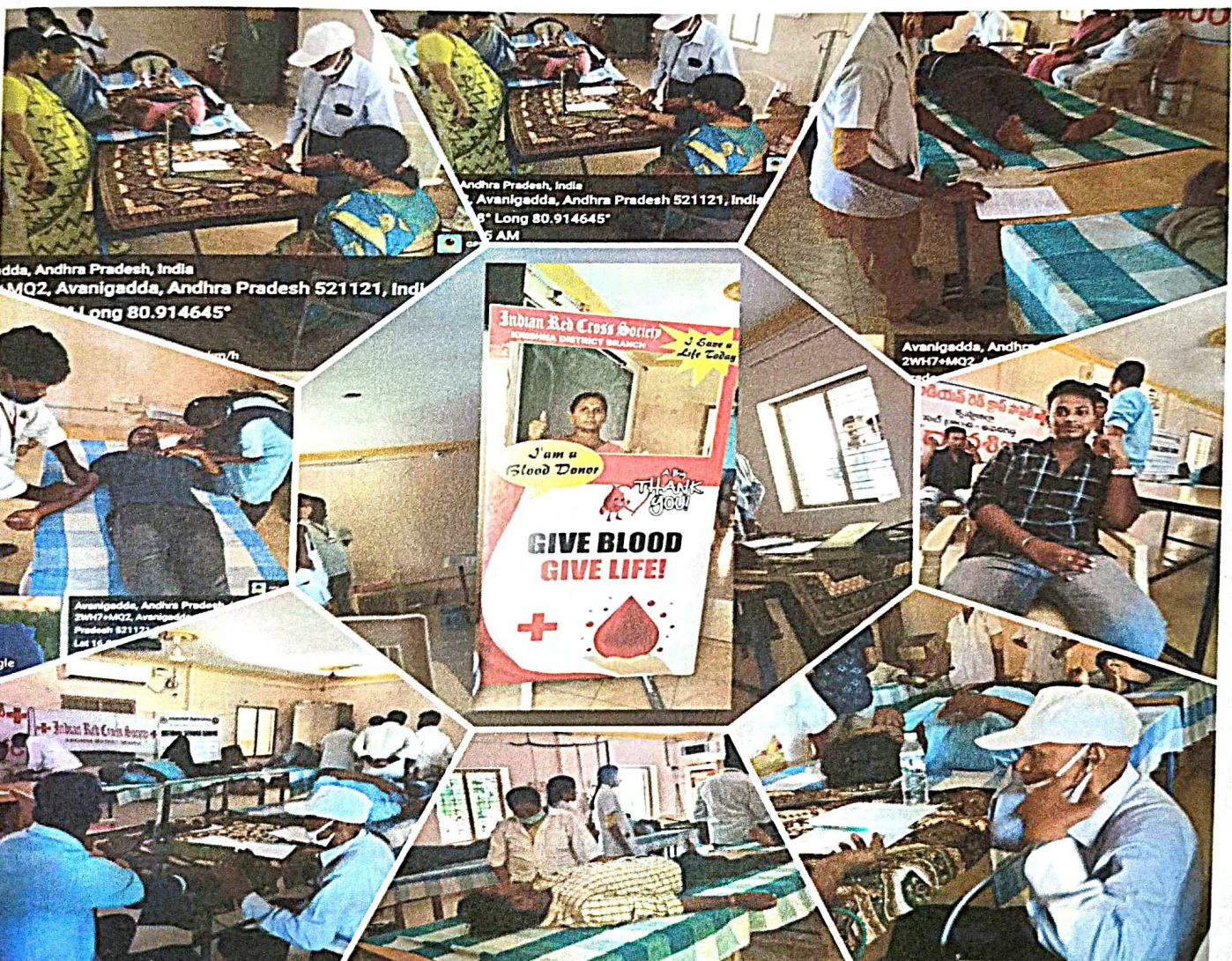
NSS VOLUNTEERS DONATING BLOOD